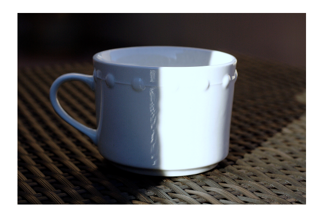
Figure 2: Canonical instance of color constancy.